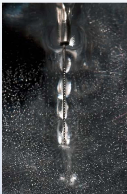
Picture taken with a high speed camera. Dr. Fridus van der Weijden (ACTA, The Netherlands), in The Power of Ultrasonics .