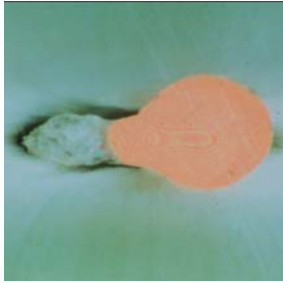
Obturation without ultrasonic

Passive ultrasonic irrigation per of a thoroughly and completely